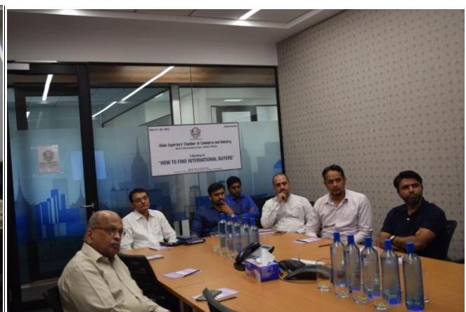
Click from the conference hall.