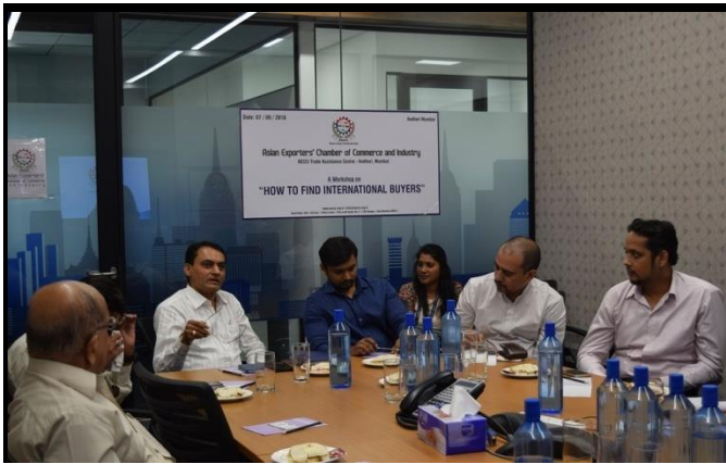
Participants sharing their experiences.