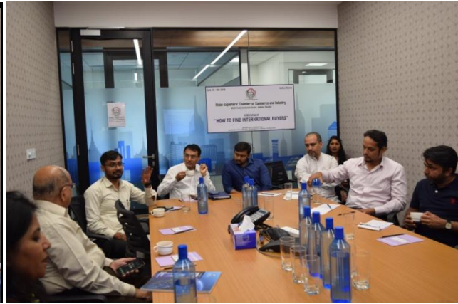
Participants sharing their experiences