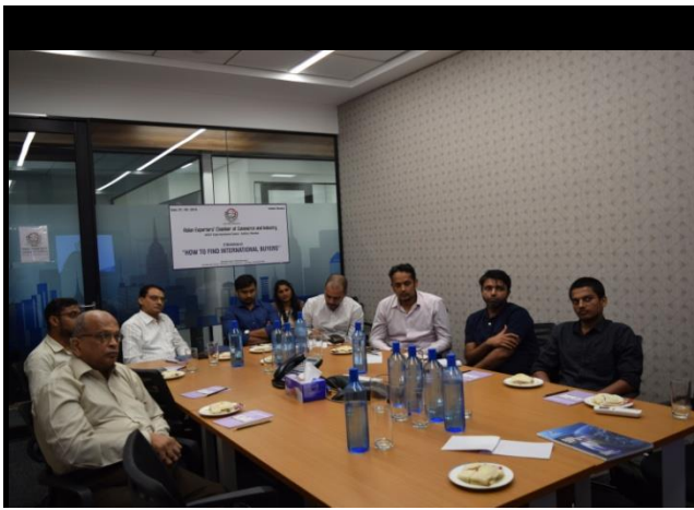
Click from the conference hall.