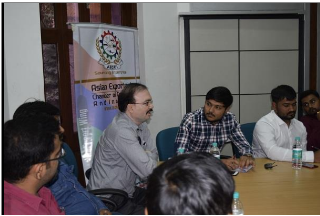
Click from the conference hall.