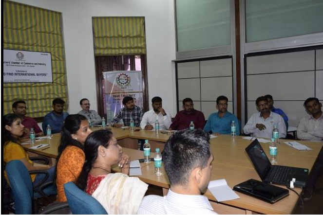
Participants sharing their experiences.