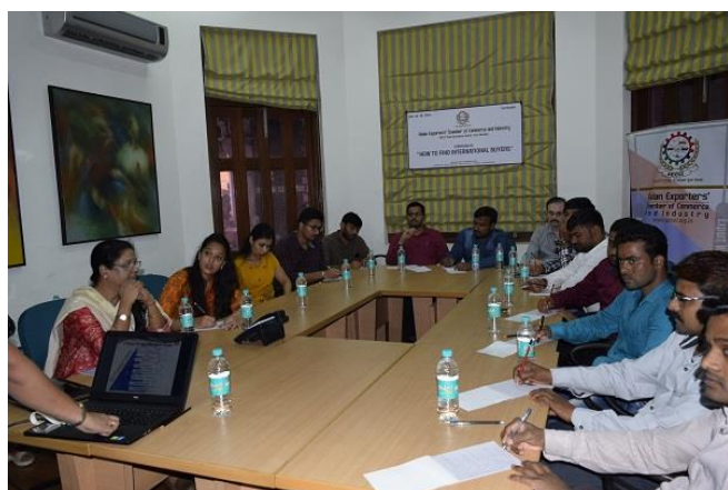
Click from the conference hall.