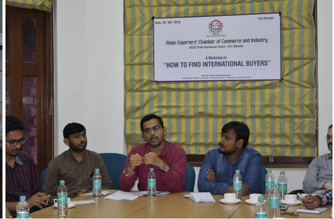
Participants sharing their experiences