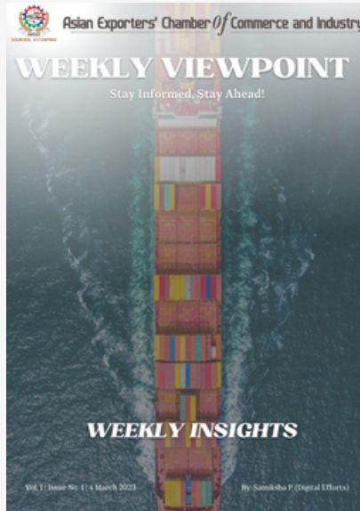
FREQUENCY - WEEKLY