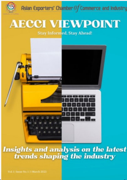
FREQUENCY - DAILY

Each issue of AECCI Viewpoint, AECCI Weekly Viewpoint, and AECCI Newsletter is distributed to lakhs of individuals, and the publications are also archived on our website for easy access.