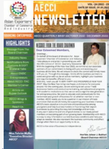
FREQUENCY - QUARTERLY