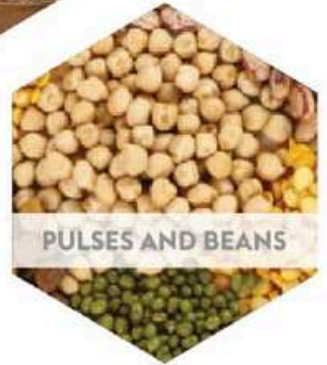
PULSES AND BEANS