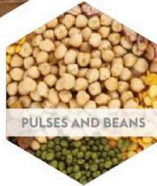
PULSES AND BEANS