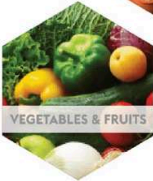
VEGETABLES & FRUITS