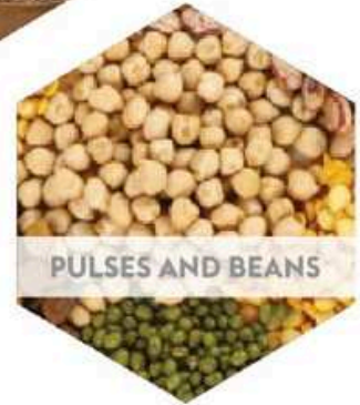
PULSES AND BEANS