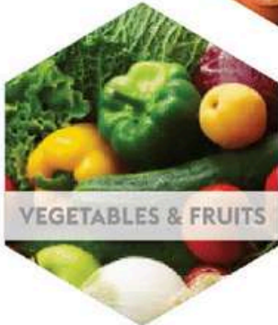
VEGETABLES & FRUITS