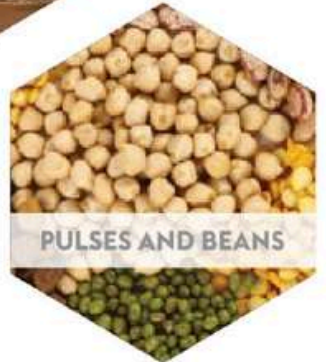
PULSES AND BEANS